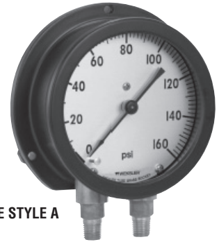
CASE STYLE A