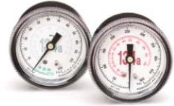
1001T, XOR gauge shown

Ashcroft Type 1005, XOR gauges are 80mm in diameter for better dial visibility. These gauges have color-coded steel cases and internally threaded polycarbonate windows.